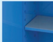
Adjustable shelves with solid PP lining