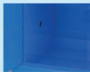
Liquid-tight Containment sump